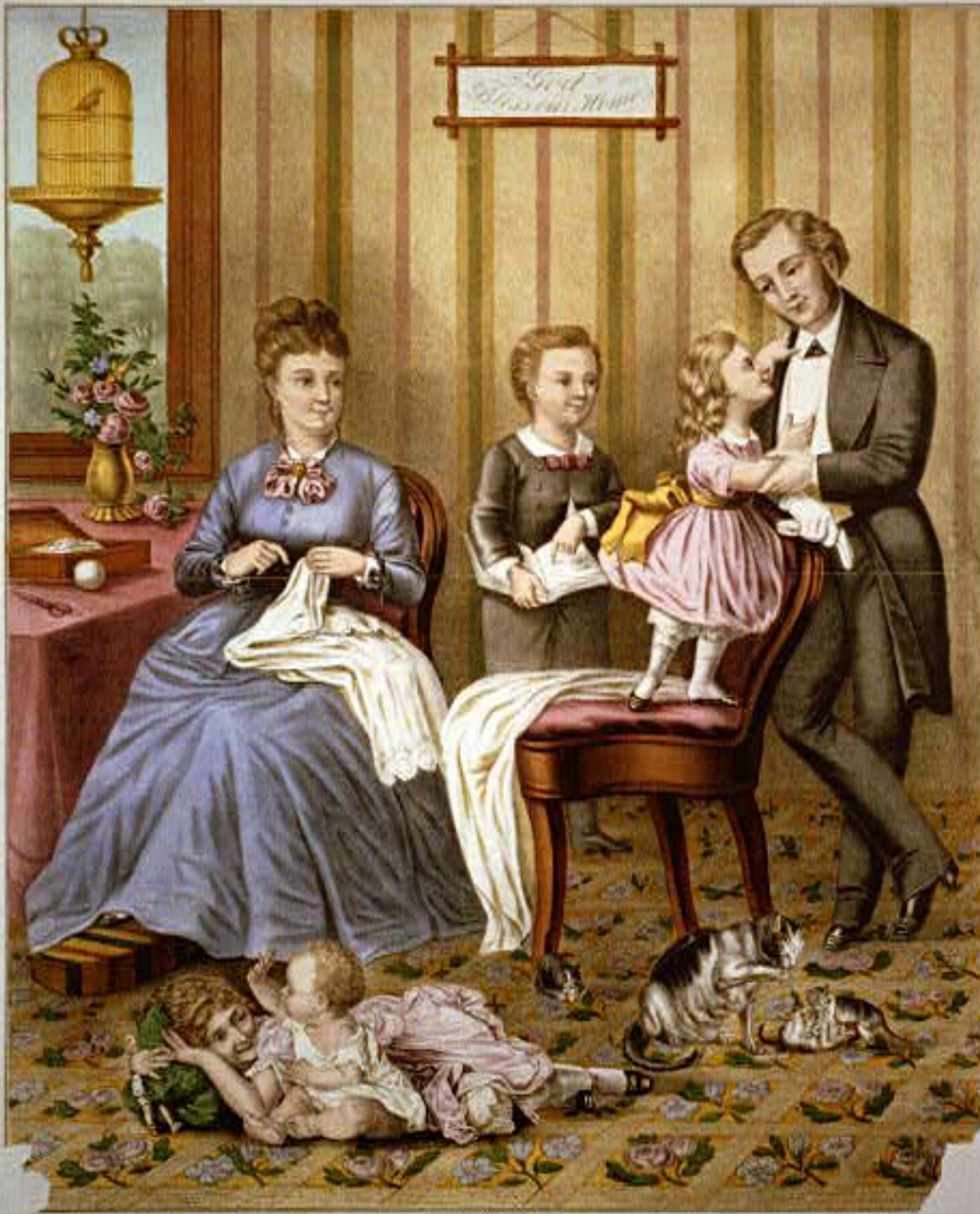
Cult of Domesticity