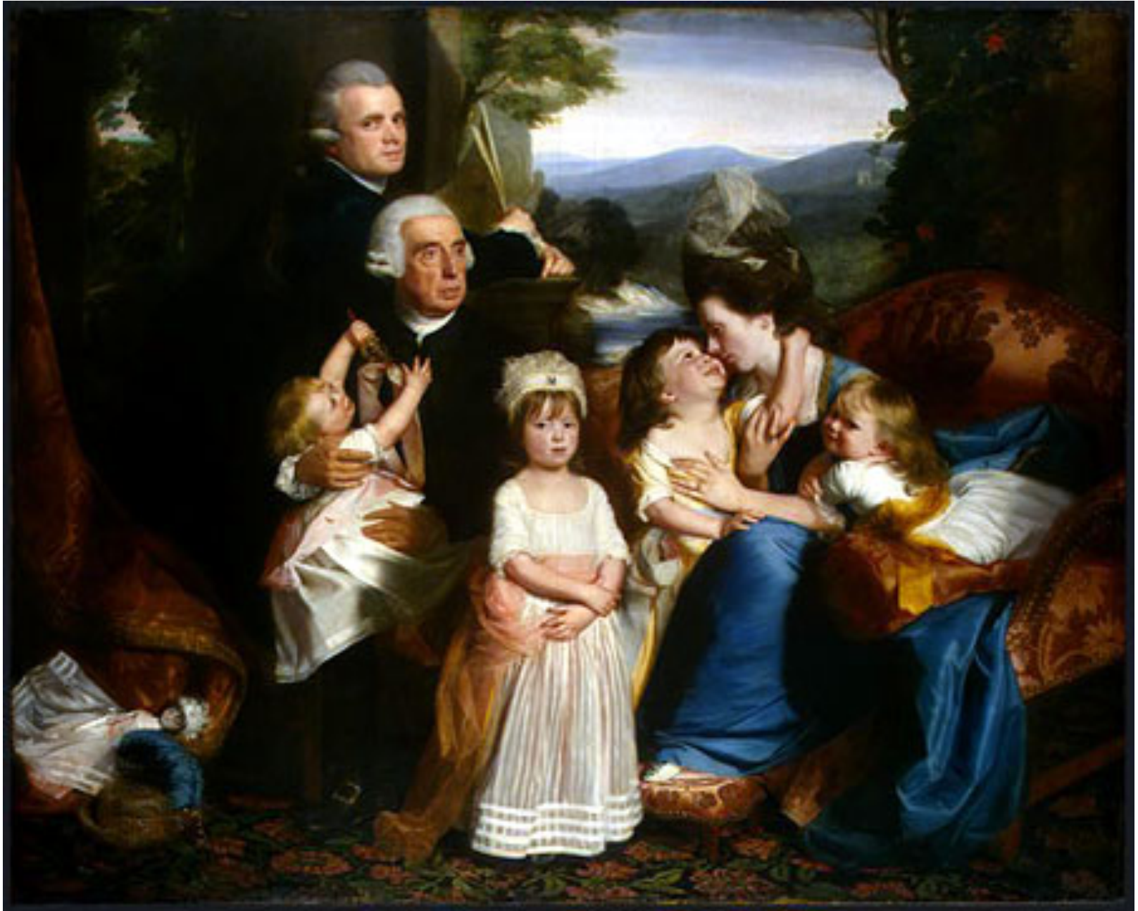
Republican Motherhood: The Copley Family, c. 1776, by John Singleton Copley; Andrew W. Mellon Fund, image