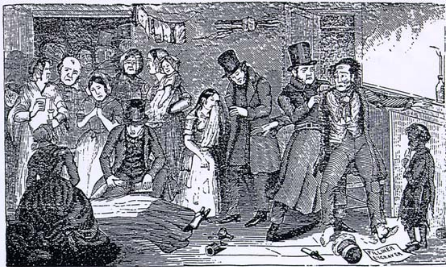
Scene 7th. — The husband, in a state of furious drunkenness, kills his wife with the Instrument of all their misery.