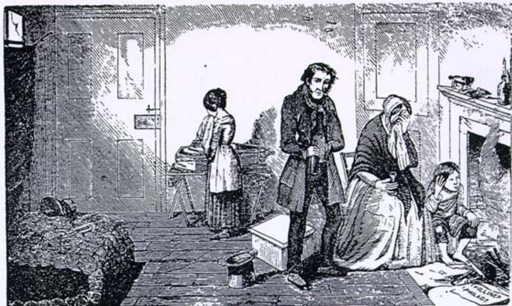
Scene 5th. — Cold, Misery and Want destroy their youngest child: They console themselves with the bottle.