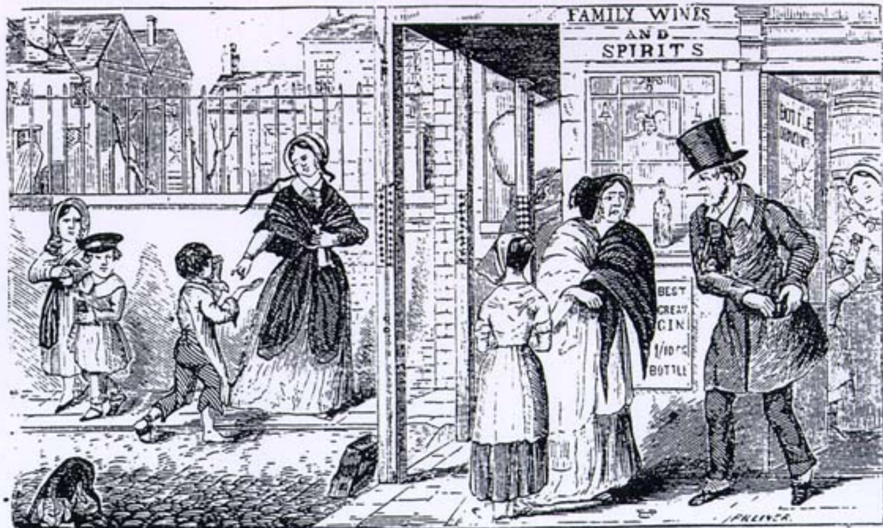
Scene 4th. — Unable to obtain employment they are driven by poverty into the streets to Beg, and by this means they still supply the bottle.