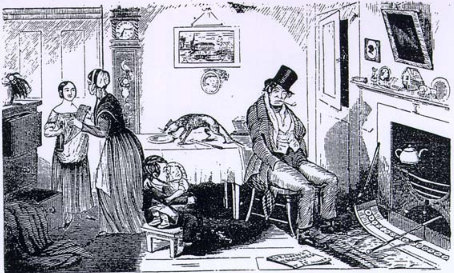
Scene 2d. — He is discharged from his employment for drunkenness: They pawn their Clothes to supply the bottle.