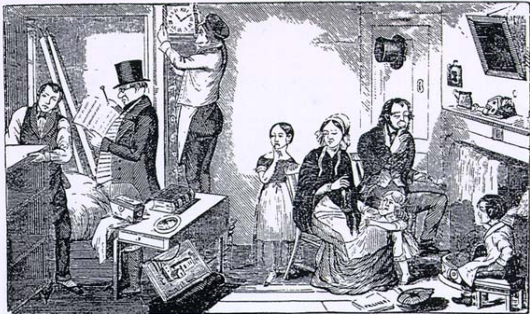
Scene 3d. — An execution sweeps off the greater part of their furniture: They comfort Themselves with the bottle.