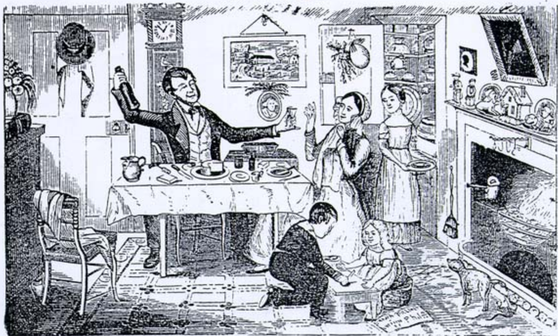
Scene 1st. — The bottle is brought out for the first time: The husband induces his wife "Just to take a Drink"